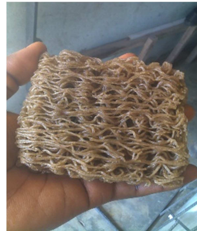
Figure 2. Noodles produced from rice broken rice, bran and AYB.

This indicates a high level of acceptance of the noodle prepared from rice, African yam beans and Rice bran composite flours, thereby improving the nutritional contents and as well as increasing the utilization of African Yam beans and also rice bran which was added as part of the ingredient.